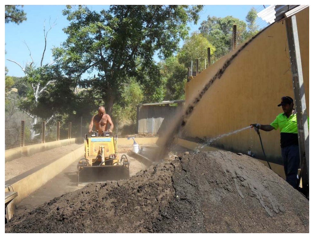
Middle level: Soil dropping out of the chute and being watered to reduce the dust. Roger is moving soil into the garden beds

Mid summer...these were long, hot 40 plus degree days, and the work was intense for everyone. But when the time came to plant, we were all rewarded for the hard preparation work.