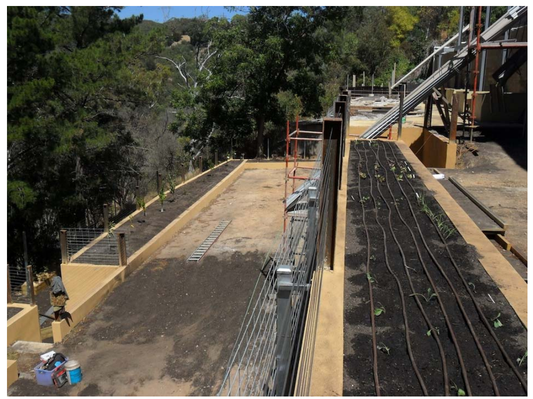
You can see the newly planted Level 1 veggie garden bed on the right side of the image.

The upper terrace level is closest to the house and only one steep flight of stairs down from the back door. One long garden bed had already been built into place here and after filling it with soil we planted all the 'go-to' veggies: late tomatoes, kale, lettuces, spring onions and a selection of herbs.