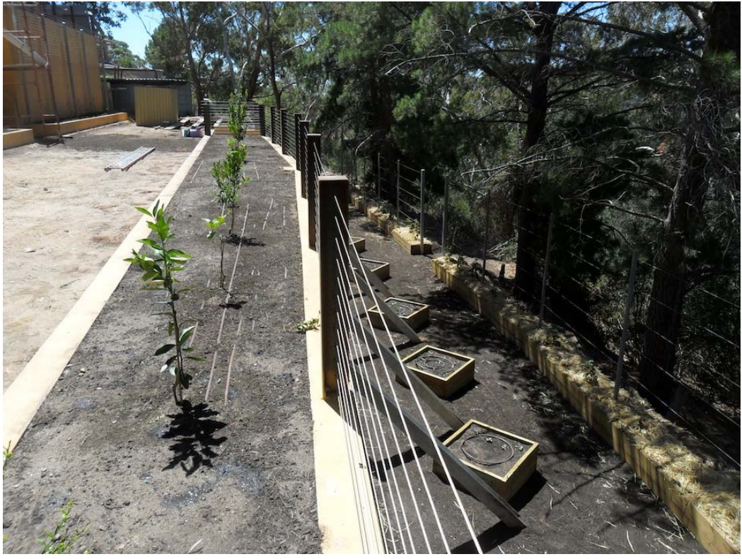
Baby fruit trees on Level 2 overlooking the veggie and berry gardens on Level 3

This is going to be an amazing food forest.