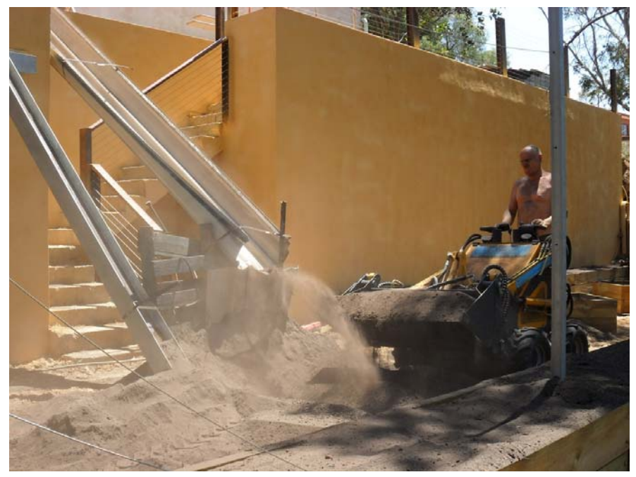
Roger moving soil at the bottom of the chute