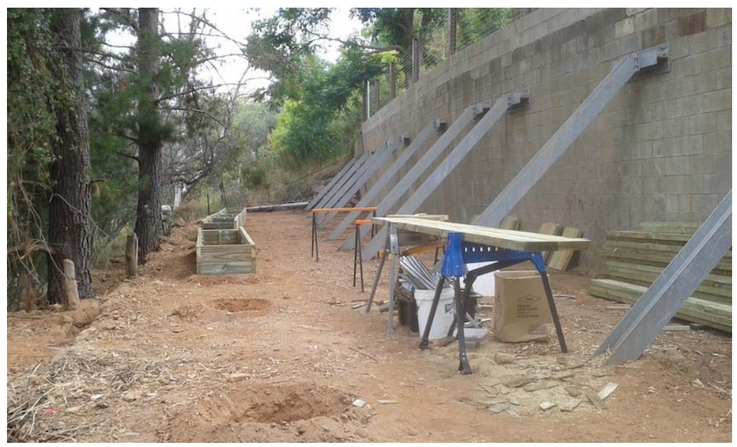
3 garden beds completed on the lower level, 27 more to go...

Just before Christmas we completed making the 30 garden beds on site. One set of beds would sit against the retaining walls and hold the bushy berries; facing these, under the pine trees would be beds for the climbing berries. In between we made a set of diamond shaped beds for a variety of veggies.